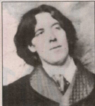
Wilde's Duchess of Padua is rarely performed