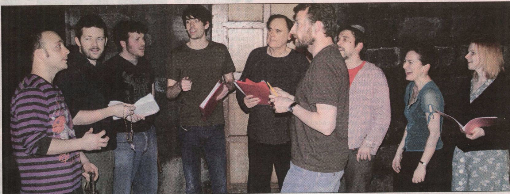
Players rehearse for the UK premiere of Oscar Wilde's little-performed tragedy, The Duchess of Padua – a play that is rumoured to be cursed